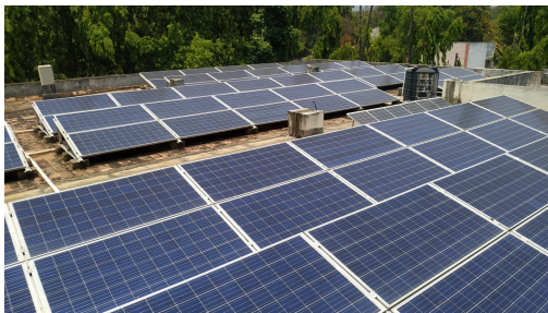
Solar Power Plant at College of Dairy Technology, SVVU, Tirupati