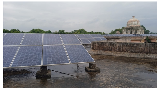
Solar Power Plant at NTR College of Veterinary Science, Gannavaram