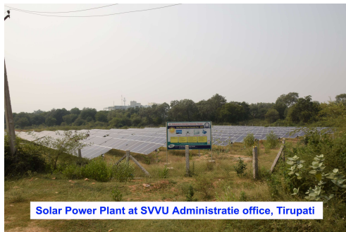
Solar Power Plant at SVVU Administrative Office, Tirupati

Power crisis is one of the most common problems in India. LED is a highly energy efficient lighting technology, and has the potential to fundamentally change the future of lighting in India. With the help of LED, we can eliminate this shortage by minimizing the wastage of electrical power or saving our generated power. Light-emitting diode (LED) is one of today's most energy-efficient and rapidly developing lighting technologies. Quality LED light bulbs last longer, are more durable, and offer comparable or better light quality than other types of lighting. LEDs, use at least 75% less energy, and last 25 times longer, than incandescent lighting. Widespread use of LED lighting has the greatest potential impact on energy savings in the campus.