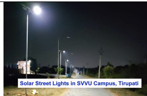
Solar Street Lights in SVVU Campus, Tirupati